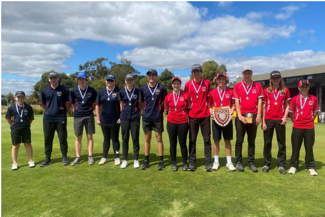
Maryborough Golf Club (Runners Up) & Buninyong Golf Club (Winners) 2021 Junior Pennant