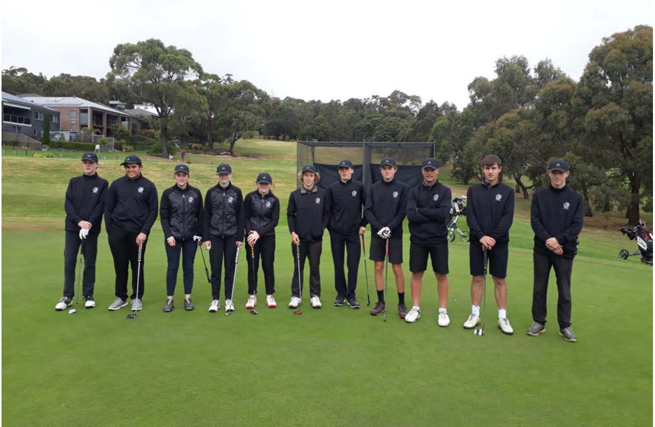
Round 5 Team V Latrobe Golf Club 2020 Victorian Junior Pennant