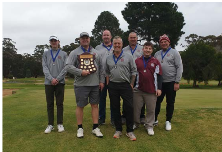
Mt Xavier Golf Club 2021 Weekend Pennant Handicap Winners