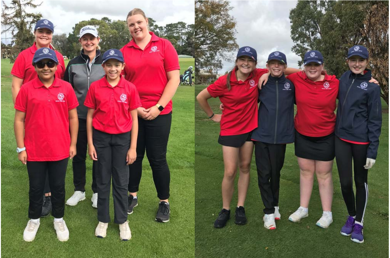
2020/21 MyGolf Girls Squad