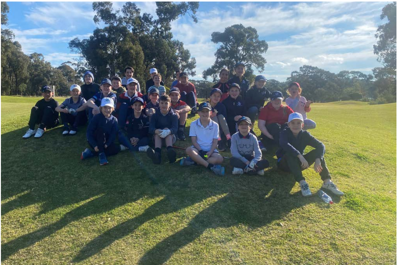
Our Future Champions 2021 Junior Challenge - Neangar Park Golf Club