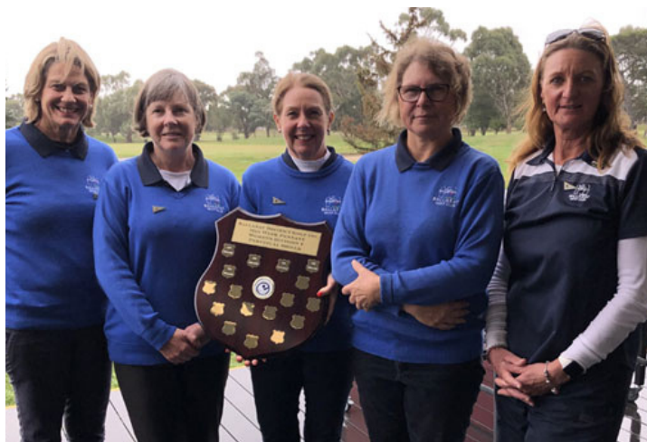
Ballarat Golf Club 2021 Midweek Pennant Division 1 Winners