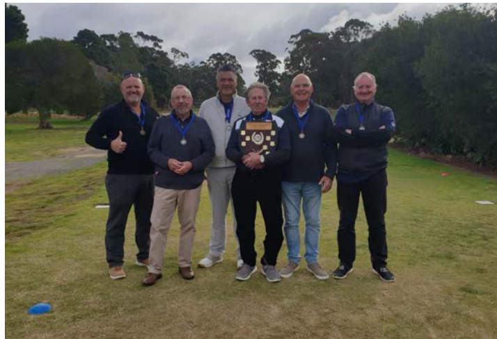
Ballarat Golf Club 2021 Weekend Pennant Senior Winners